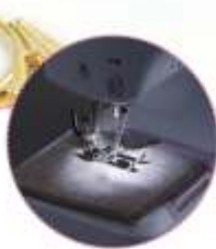
Long Lasting Bright LED Light