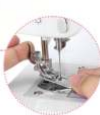
Snap on Presser Foot