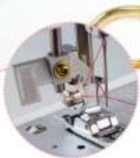
Automatic Needle Threader